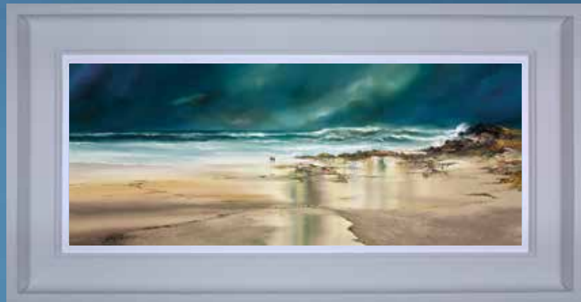
Ocean Quest, Limited Edition of 195, Embellished Canvas on Board, 34" x 14", £650