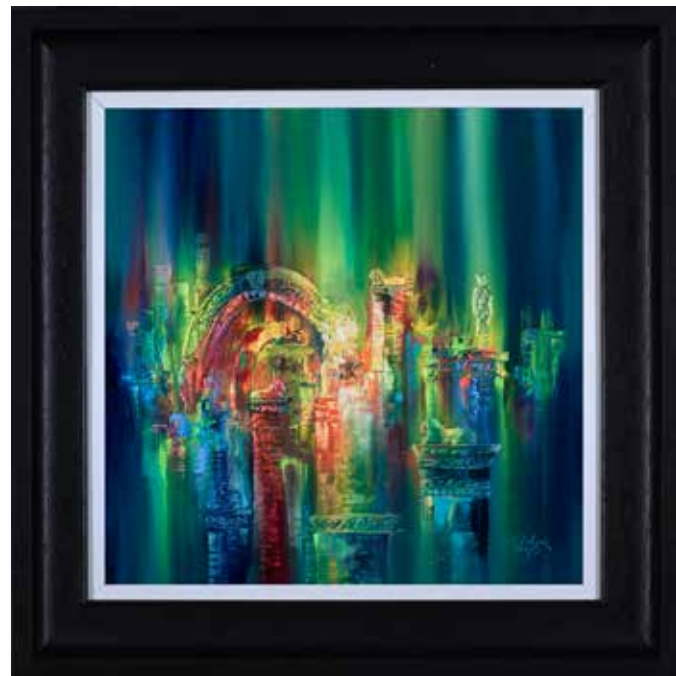
The Lost City, Limited Edition of 195, Embellished Canvas on Board, 20" x 20", £575