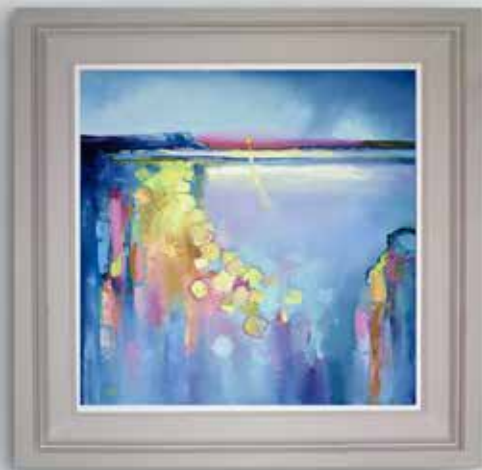
Sun Reflections II Original Painting 24" x 24"

You are warmly invited to come and meet rising star