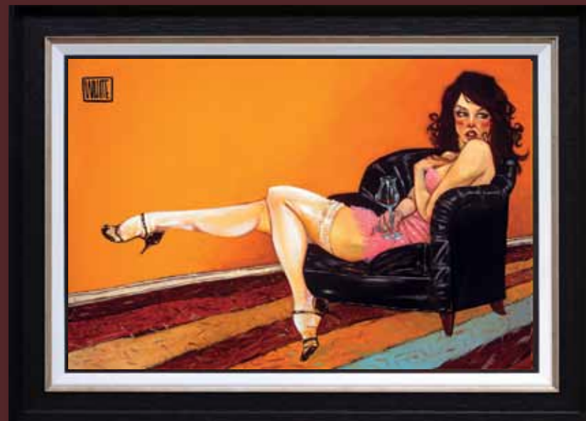
Embellished Canvas Edition of 135 • 30" x 20" • £1295