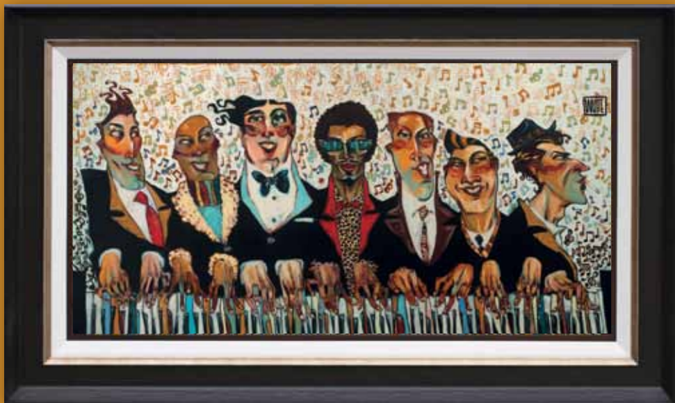
Embellished Canvas Edition of 135 • 40" x 20" • £1625

This painting came about like so much of my work through my personal experience of travelling around, nights out and my liking for finishing the evening in a piano bar. I don't like the noise and clamour of clubs where you can't pick up conversation – I much prefer a bar, but because I like some background noise I love a piano bar. If the conversation goes off in a direction I don't care to follow, (religion or politics!) I tend to zone out and listen to the music, and often start sketching on whatever is available – usually a napkin, unless I have one of my sketchbooks with me. I love to capture people in their element doing what they love. For this one I created masses of sketches then began to compile them into a composition and soon realised that it was really working for me. I loved the colours, the energy, the feeling of the music, and to me it had a rhythm of its own.