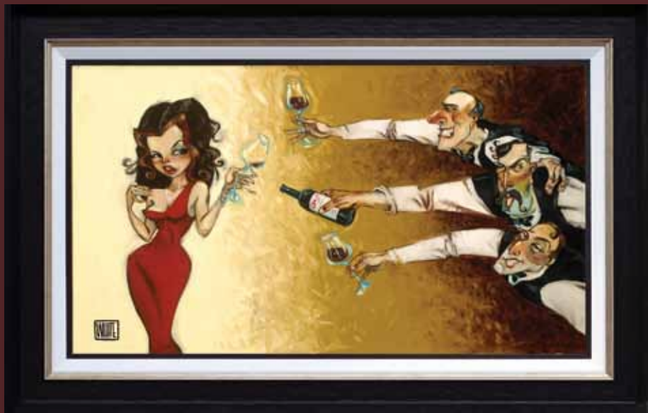
Embellished Canvas Edition of 135 • 32" x 18" • £1250