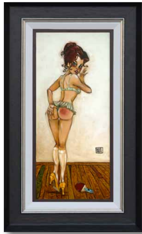
Embellished Canvas Edition of 135 14" x 32" • £995