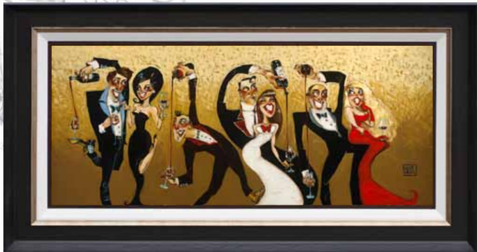
Embellished Canvas Edition of 135 • 45" x 19" • £1695

This piece came about thanks to one fan's comment. He asked me to write it on the back of a painting he bought for his wife, and it simply spoke to me. The painting immediately began to take shape in my mind. I wanted to use the wine bottles as a prop for the men's showboating, as if they were peacock feathers. This is the way they're going to get their women – how they pour their wine! I wanted each guy to do his own unique thing with the girl he's after – arm draped over the back etc. I always think of wine as a little bit more staid than other drinks so it was fun to put this rather serious drink into the hands of flirtatious people just in it for a fun night out.